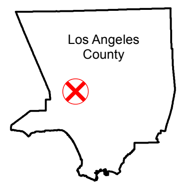
Scale of this index: 1:50,000